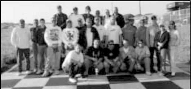
Alpha Phi participants

Alpha Phi raised funds for Multiple Sclerosis with thirty attendees while learning to race karts at Jim Hall Kart Racing School. The group regularly gets together to have fun and donate a portion of the proceeds from their event to their charity. Pictures from their event can be viewed on www.4Yourpictures.com .